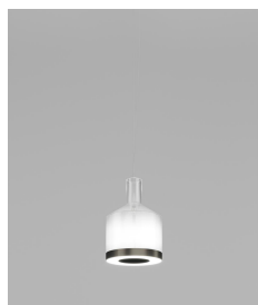
MEDEA SP 1