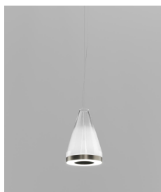
MEDEA SP 3